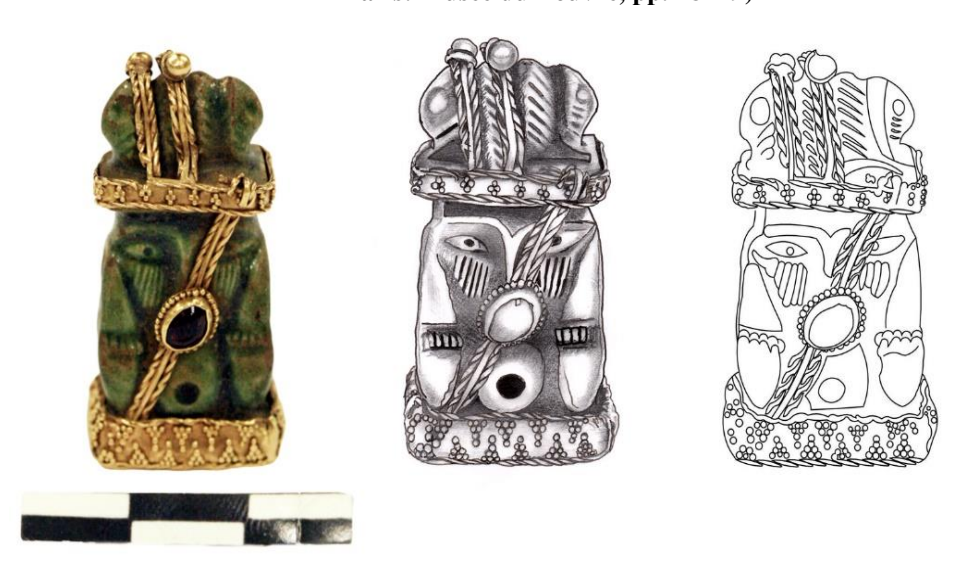
Figure 1: Front side of Bes figurine from Al-Faw

(Al-Ghabban et al. (ed.) (2010), Roads of Arabia archaeology and history of the kingdom of Saudi Arabia, Paris: Musée du Louvre, pp. 28-29)