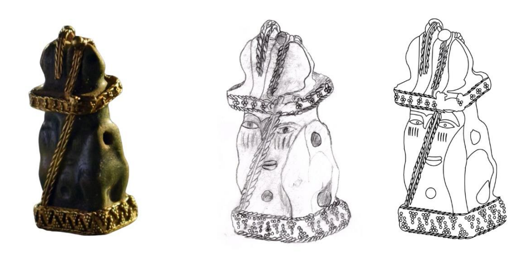
Figure 2: Back side of Bes figurine from Al-Faw