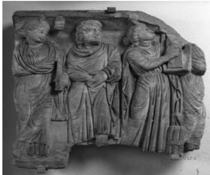
A side part of a coffin that depicts two of the Muses with an intellectual figure between them