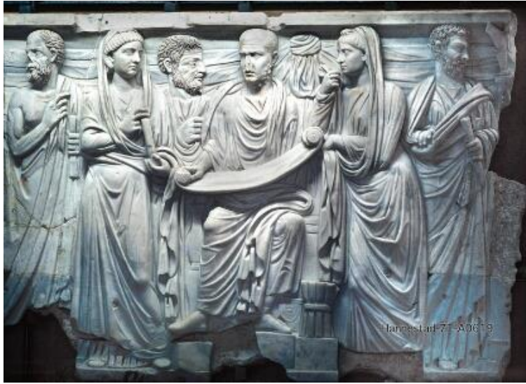
The intellectual with the Muses who read an open roll