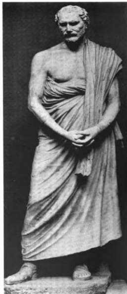
Statue of Demosthenes