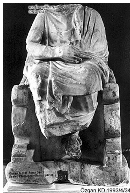
Some figures of the statue of the Orator