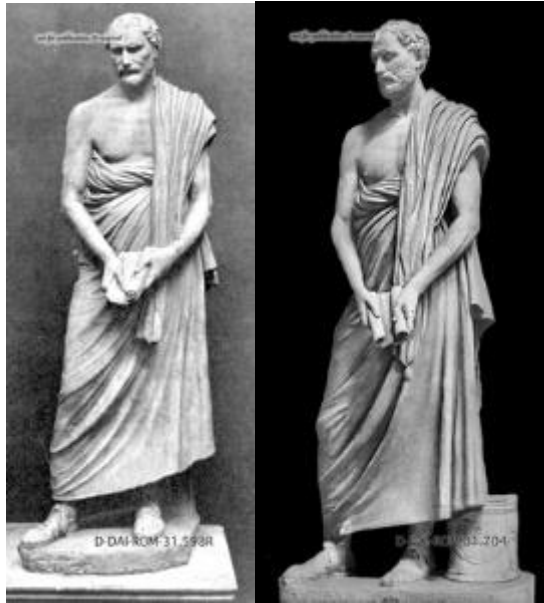
the statues of Demosthenes