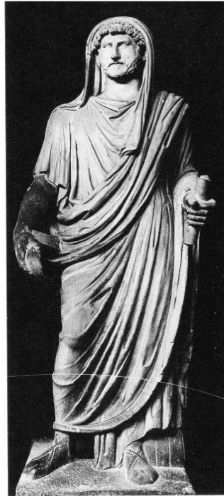
Statue of Emperor Hadrian