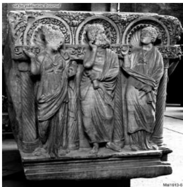
The intellectual with the Muses who hold a papyrus roll