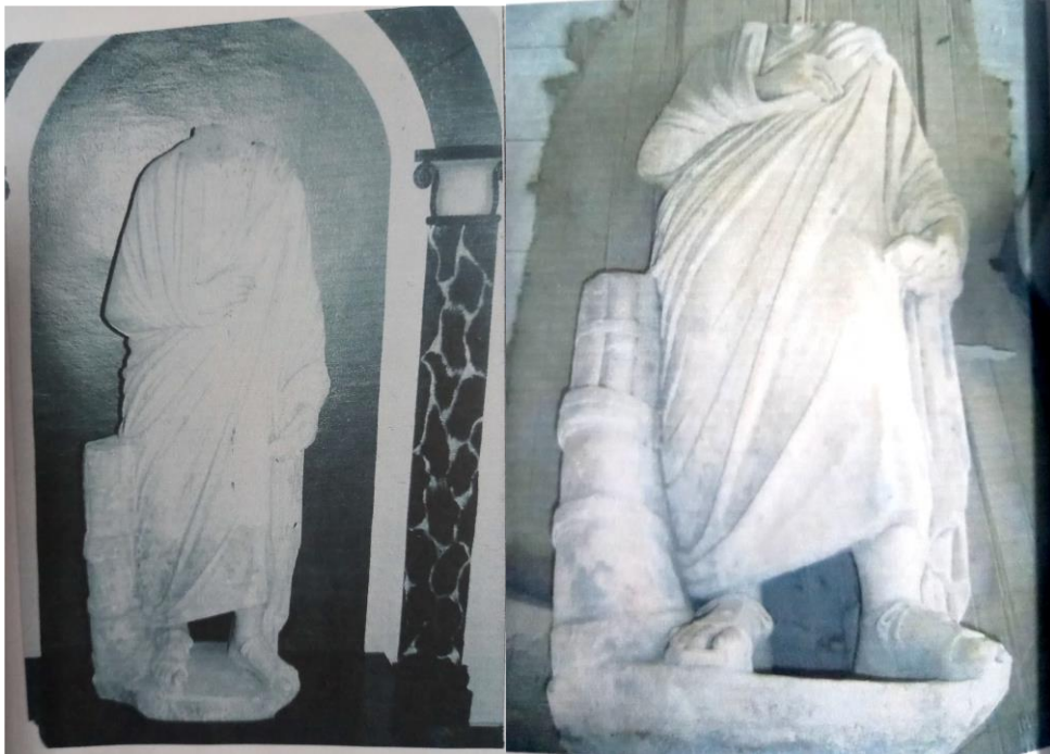
Statue of Tanta Museum