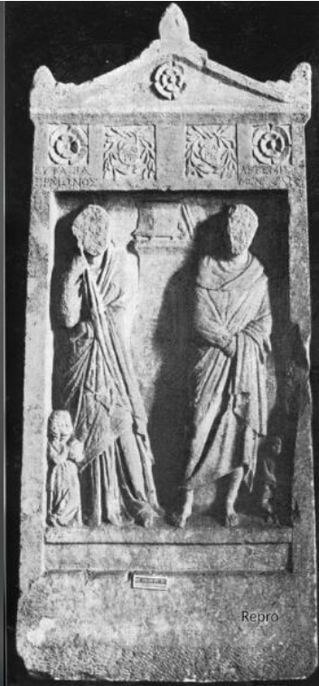
Stelai of Smyrna